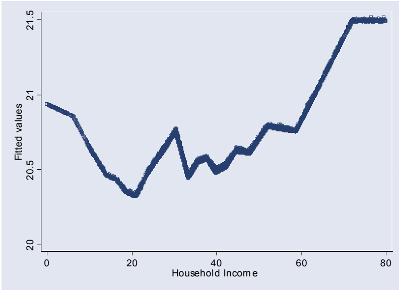
Figure 2. Relation between Income and Risk, Women